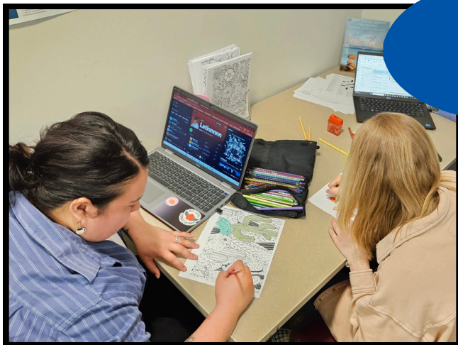
University of Iowa created a "Calm Cove" area of the office where staff can complete puzzles, crosswords, or color to spend a few minutes destressing! (Above)