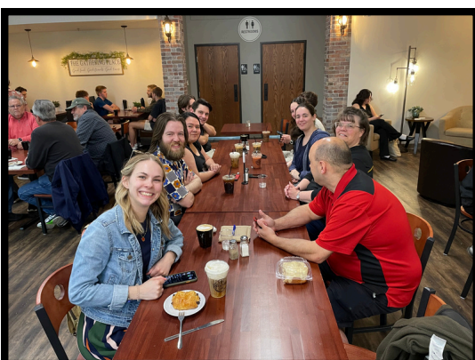
Staff enjoyed going to either breakfast or lunch at The Encounter Cafe. (Below)

What are you or your offices doing to promote self-care during this stressful time, either at home or at work?