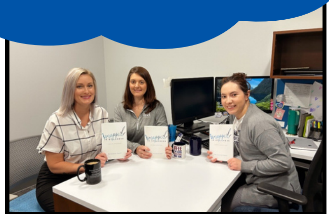
Marshalltown Community College is promoting self-care by having quality time on our personal retreat. Pictured reading "Wrapped in Stillness."

What are you or your offices doing to promote self-care during this stressful time, either at home or at work?