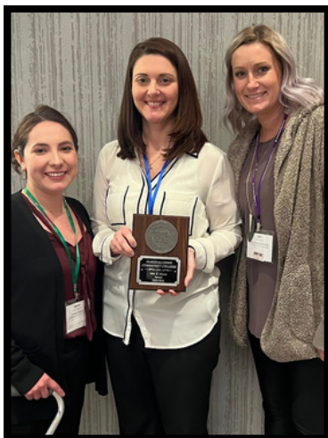
Marshalltown Community College